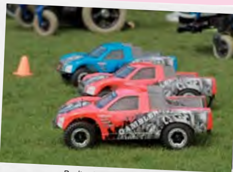
Radio Controlled Cars