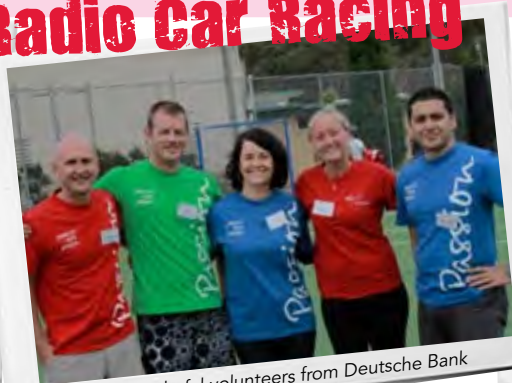
The wonderful volunteers from Deutsche Bank