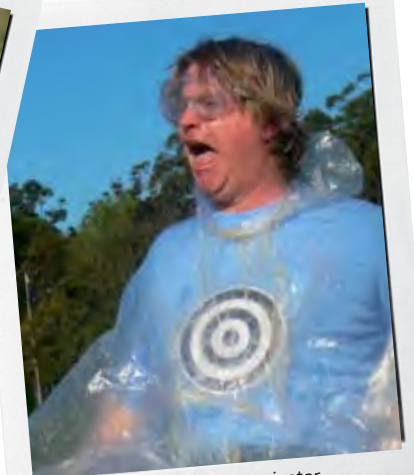
Brett the Eggterminator