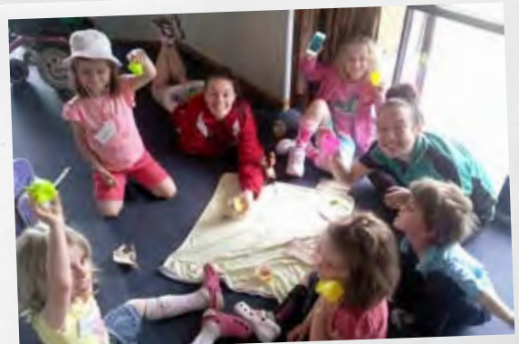
The young ones loved their tea party