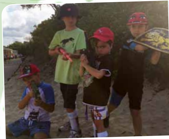
Don't mess with these guys!