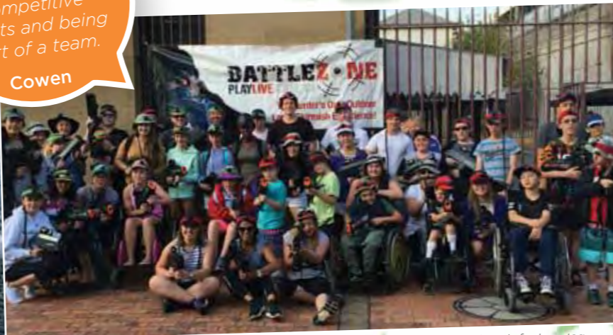
The team was pumped and ready for laser tag