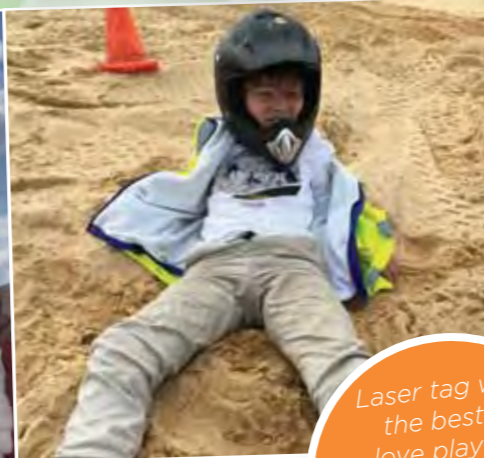
This Quad biking is tough work