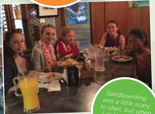
The girls loving Party Night

Sandboarding was a little scary to start, but when I did it I loved it! It was the best!