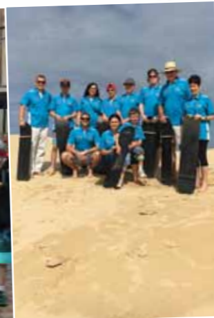
Ready to hit the sand with the Governor!