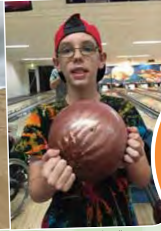
When the rain came, bowling was the activity of choice

I just love camp! I wish that we stayed at camp for a whole year and that our parents just came and visited for one week!