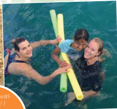
Azelia braved the slide