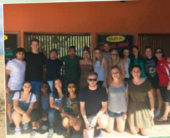
Just some of the awesome Carers!