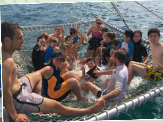
Everyone jumped in and had a go at Boomnetting!