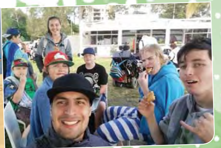
Nothing beats fish and chips after a boat cruise