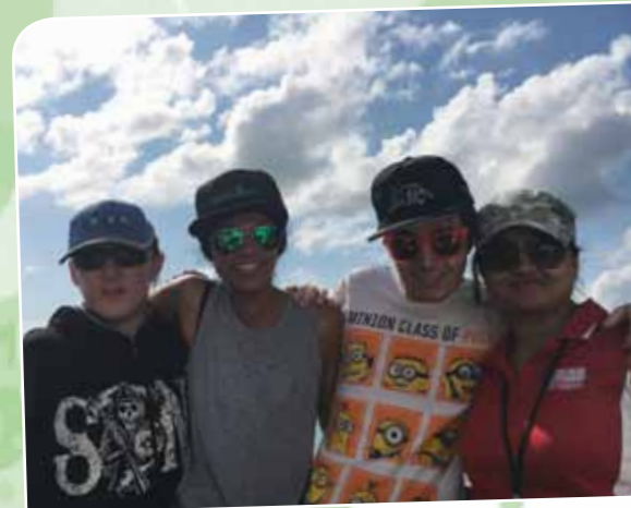
Perfect weather for a Dolphin Cruise