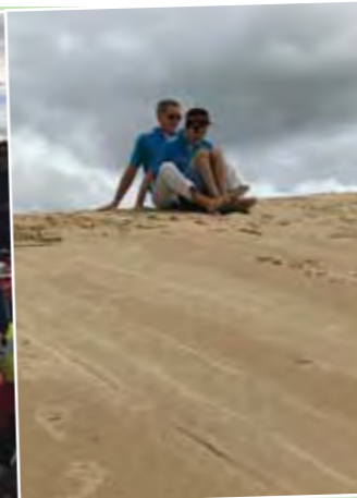
And they are off!