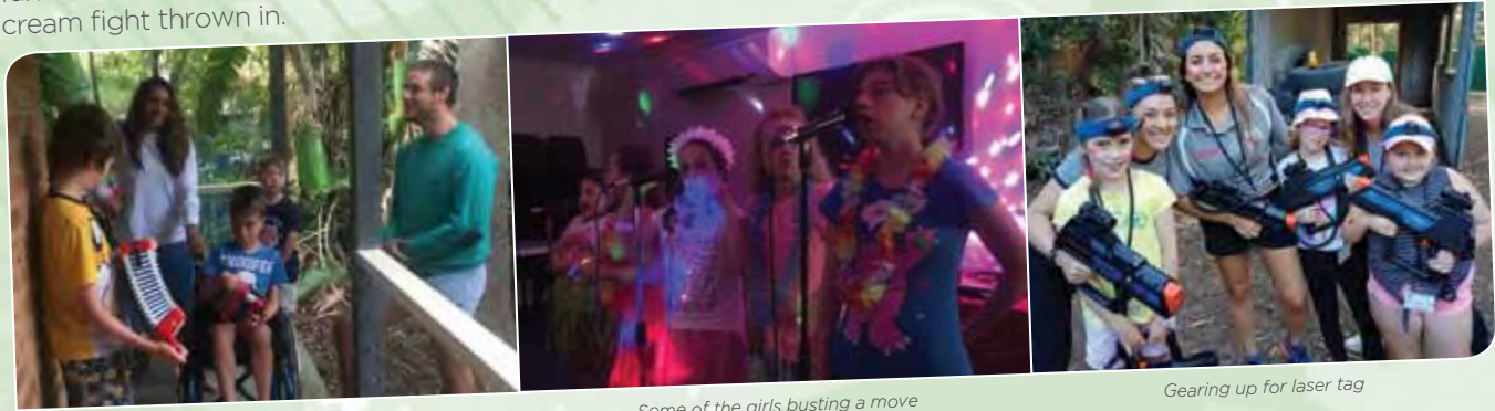
Morning wake up call!

Our first activity on Monday was the obligatory Easter egg hunt, and in the evening we got our hearts pounding with a stealthy game of spotlight. The next morning we were straight into one of the old favourites – team laser tag – before everyone put their fear of heights aside for the high ropes course. This was an amazing spectacle, and it was fantastic to see how everyone challenged themselves. After lunch we enjoyed the giant slip and slide with a shaving cream fight thrown in.