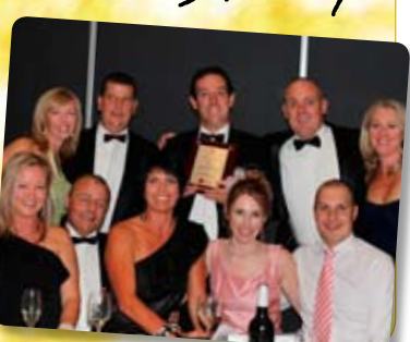
Fri 3 May

Our popular annual event held within a beautiful modern venue, with tranquil views overlooking the Lake.