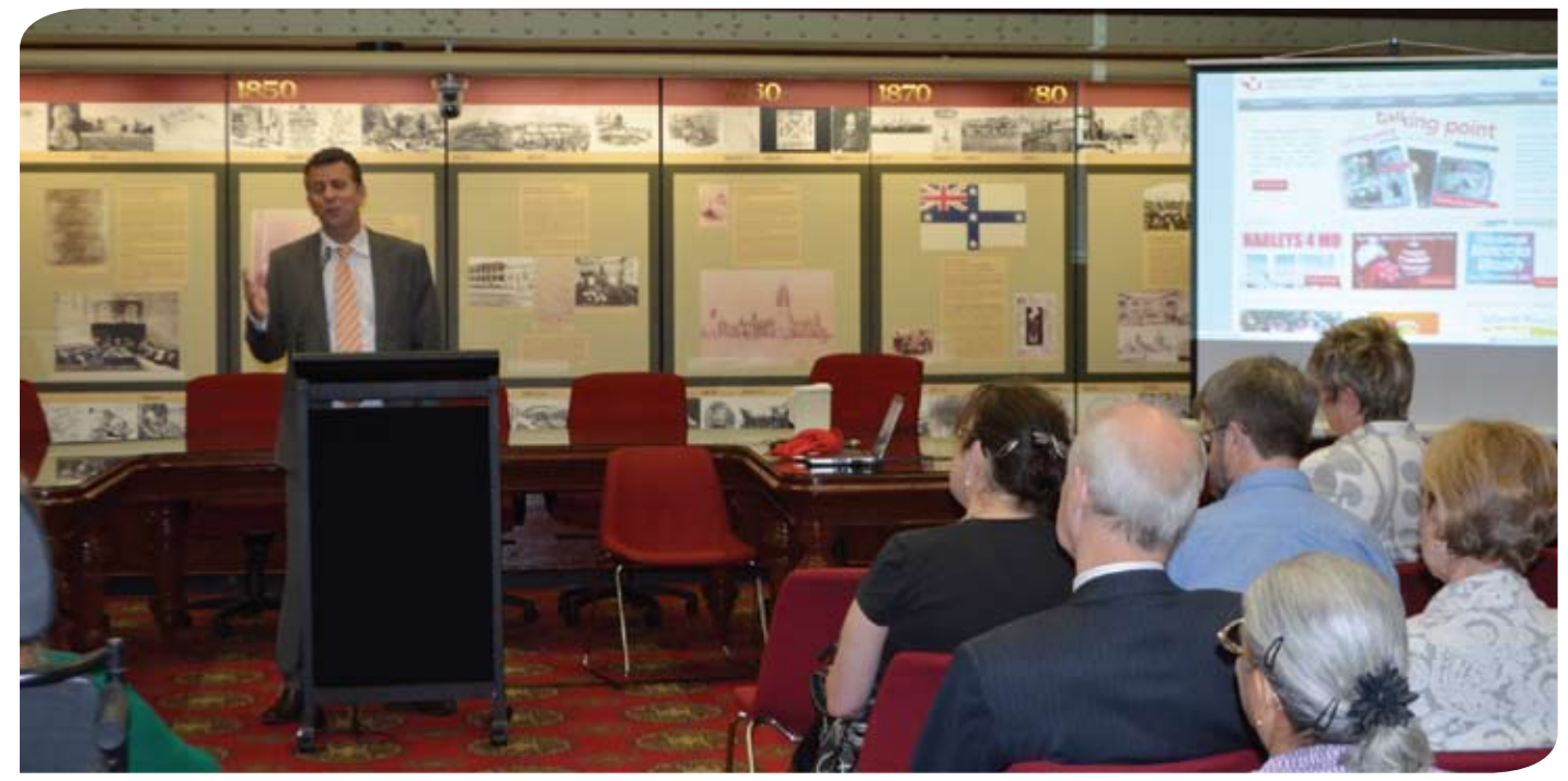
Minister Andrew Constance at the launch of the MDNSW Training Program website, 14 November 2012