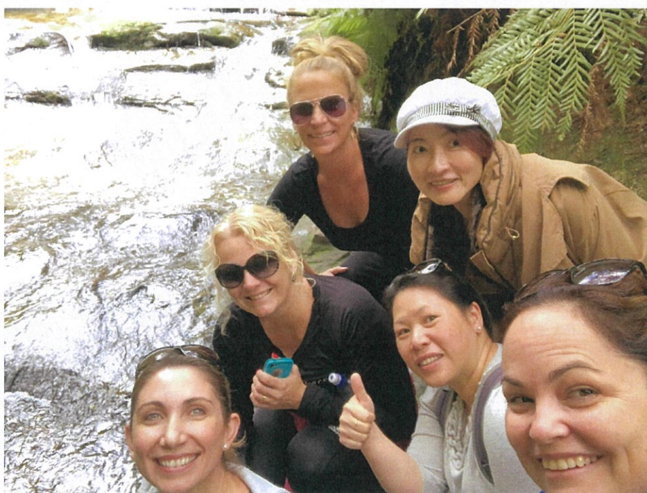
Mums Retreat March 2018 Blackheath

WHO HAVE SO KINDLY GIVEN TO US THIS FINANCIAL YEAR