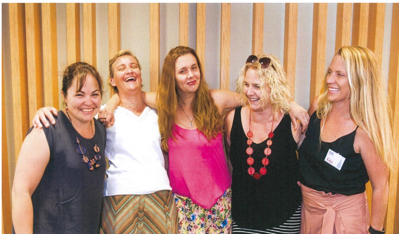
Christmas Metro Party 2017