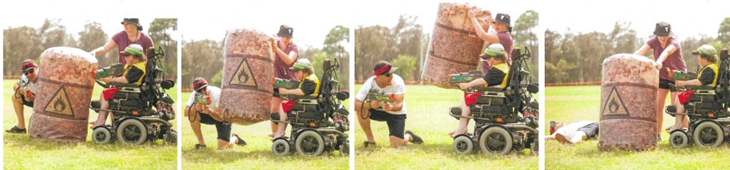
Camp Kula N' Gadu 2017

Support through Clinics Support to service providers Cough Assist Machine Loan Program Schools Boccia Equipment Loan Program Client Newsletter The Duke of Edinburgh's Award Community events & sporting program Support to National Electric Wheelchair Sports (NEWS)